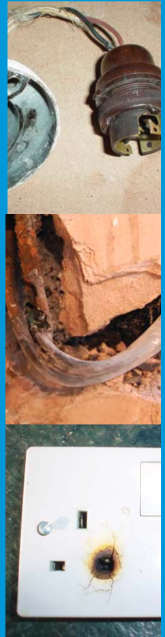
Typical examples of potentially dangerous electrical installations